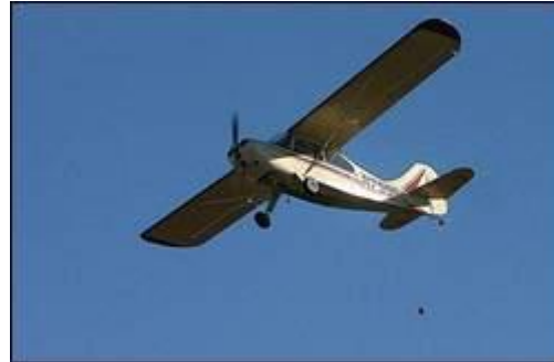
Megan Horne, 11, of Ossipee, throws a pumpkin from a plane at 400 feet during the turkey bomb contest at Skyhaven Airport in Rochester on Saturday morning.

The inaugural "turkey bombing" challenge continues today from 10 a.m. to 3 p.m. at the airport, located at 238 Rochester Hill Road — Route 108. All are welcome to watch or try themselves.